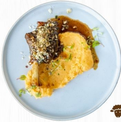
Double Stew Lamb Shank

With orange mashed potato and pistachio gremolada