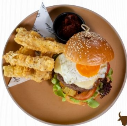
Open Kitchen Burger

Charcoal grilled beef burger, with SEED Farm Thomas tomato, Karprow cheese, egg, grilled Phuket pineapple and French fries