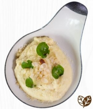
Mash Potato 150 THB