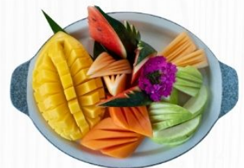
Fruit Platter 310 THB