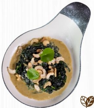
Creamy Spinach, Phuket Cashew Nut 150 THB