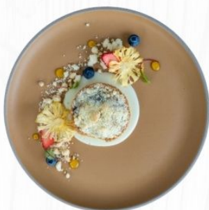
Phuket Pineapple Crumble Tart 375 THB