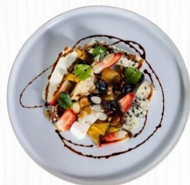
Open Kitchen Cheese Platter

Variety of amazing boards Chiang Mai cheese with homemade jam, green olive tapenade and biscuits