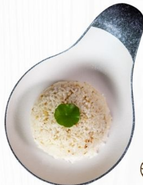
Gaba Hom Garlic Butter Rice 100 THB