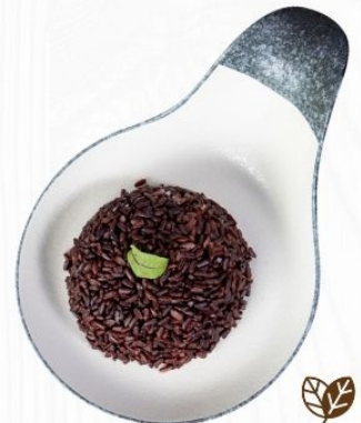
Sisakate Steamed Rice Berry 100 THB