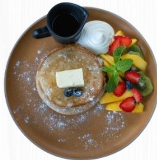
Coconut Buckwheat Pancake

With fresh fruit, honey, and whipping cream