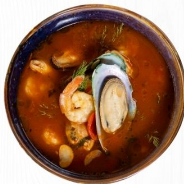
Andaman Seafood Soup

with Rairloom tomato, Thai sweet basil, and prawn broth