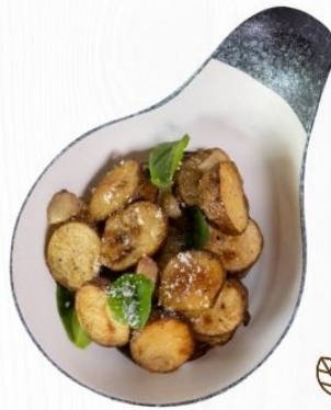
Duck Fat Roasted Baby Potato 150 THB