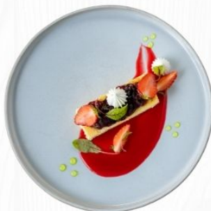
Chiang Mai Strawberry Cheesecake 390 THB