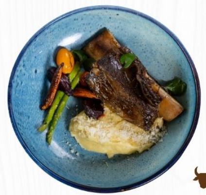
Braised Short Rib

Slow cook short rib with SEED Farm garlic mashed potato, and beef jus