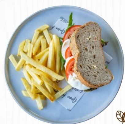
Tomato and Mozzarella Sandwich

Sourdough bread, SEED Farm Thomas tomato, buffalo cheese, lettuce, SEED Farm pesto sauce, and French fries