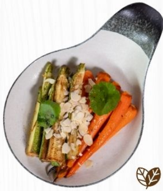
Sautéed Baby Carrot & Zucchini 150 THB