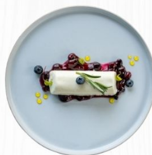
Open Kitchen Blueberry Panna Cotta 375 THB