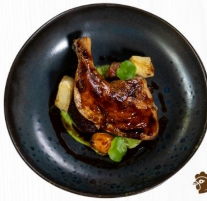
Roasted Chicken Leg

Phuket farm roasted free-range chicken leg, organic broccoli puree, roasted potato, and Chang beer chicken jus