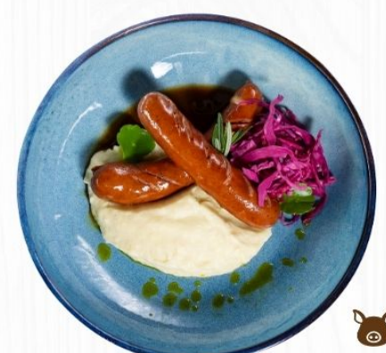
Krainer Cheese Sausage

Grilled pork cheese sausage served with SEED Farm garlic mashed potato, pickle red cabbage, and caramelize onion pork jus