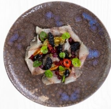
Twice Cured Brown Marbled Grouper

Homemade cured sustainable brown marbled grouper with smoked SEED Farm pickled beetroot carpaccio, dried cherry tomato, caper berries, caviar, and honey, lemon, mustard, and ginger vinaigrette