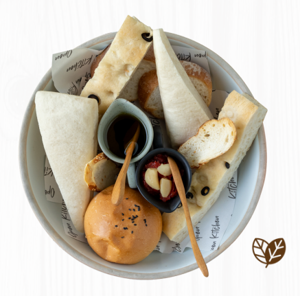
Bread Bowl butter, and sundried tomato dip