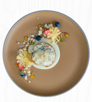
Phuket Pineapple Crumble Tart