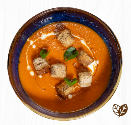
Open Kitchen Roasted Tomato Soup With rosemary focaccia crouton