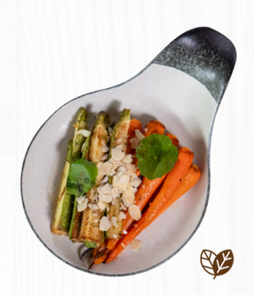
Sautéed Baby Carrot & Zucchini 150 THB