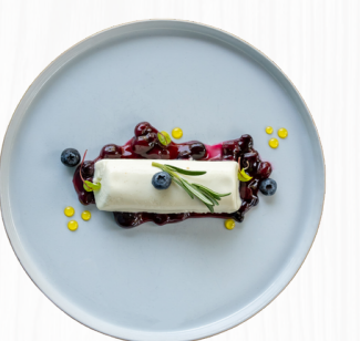
Open Kitchen Blueberry Panna Cotta