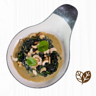
Creamy Spinach, Phuket Cashew Nut 150 THB