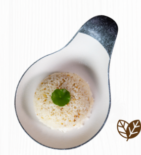
Gaba Hom Garlic Butter Rice 100 THB