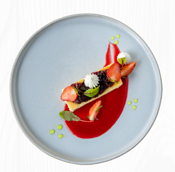
Chiang Mai Strawberry Cheesecake