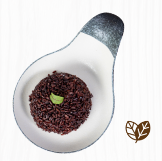
Sisakate Steamed Rice Berry 100 THB