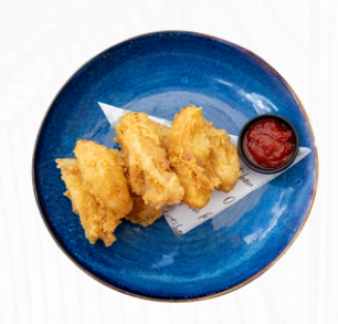
Homemade French Fries 150 THB